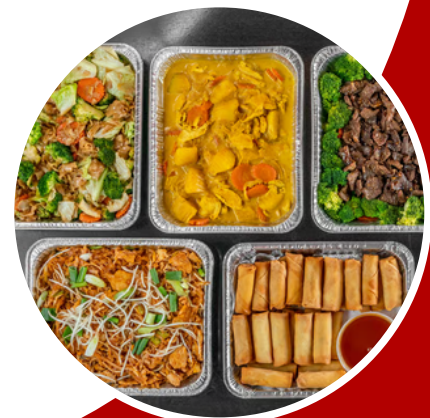
Full Tray Size